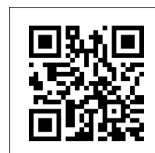
Scan QR code for more technical information and code numbers