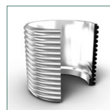
Flexible two-in-one connection