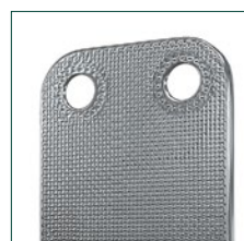
Innovative micro plate design